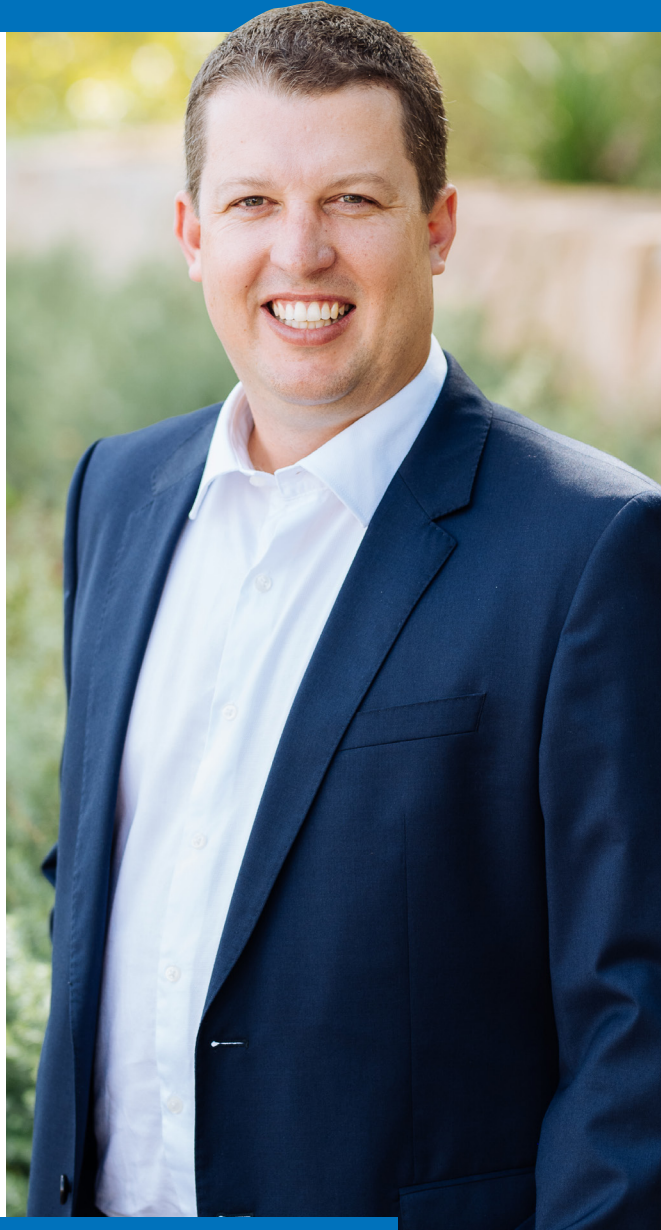
Cessnock Council Mayor Jay Suvaal.