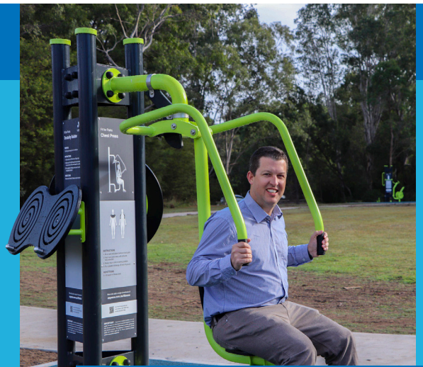
Mayor Suvaal at Chinaman's Hollows Fitness Loop

Here are some of the grants we have won since January 2023: