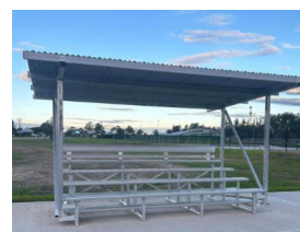
Branxton District Netball Club's new netball court (pictured left) and sheltered grandstand (right).

Cessnock City Council is excited to announce the finalisation of works to extend the Branxton District Netball Club's netball and tennis courts.