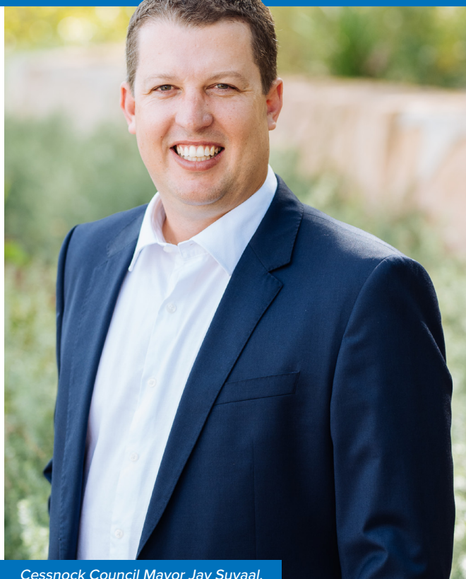
Cessnock Council Mayor Jay Suvaal.