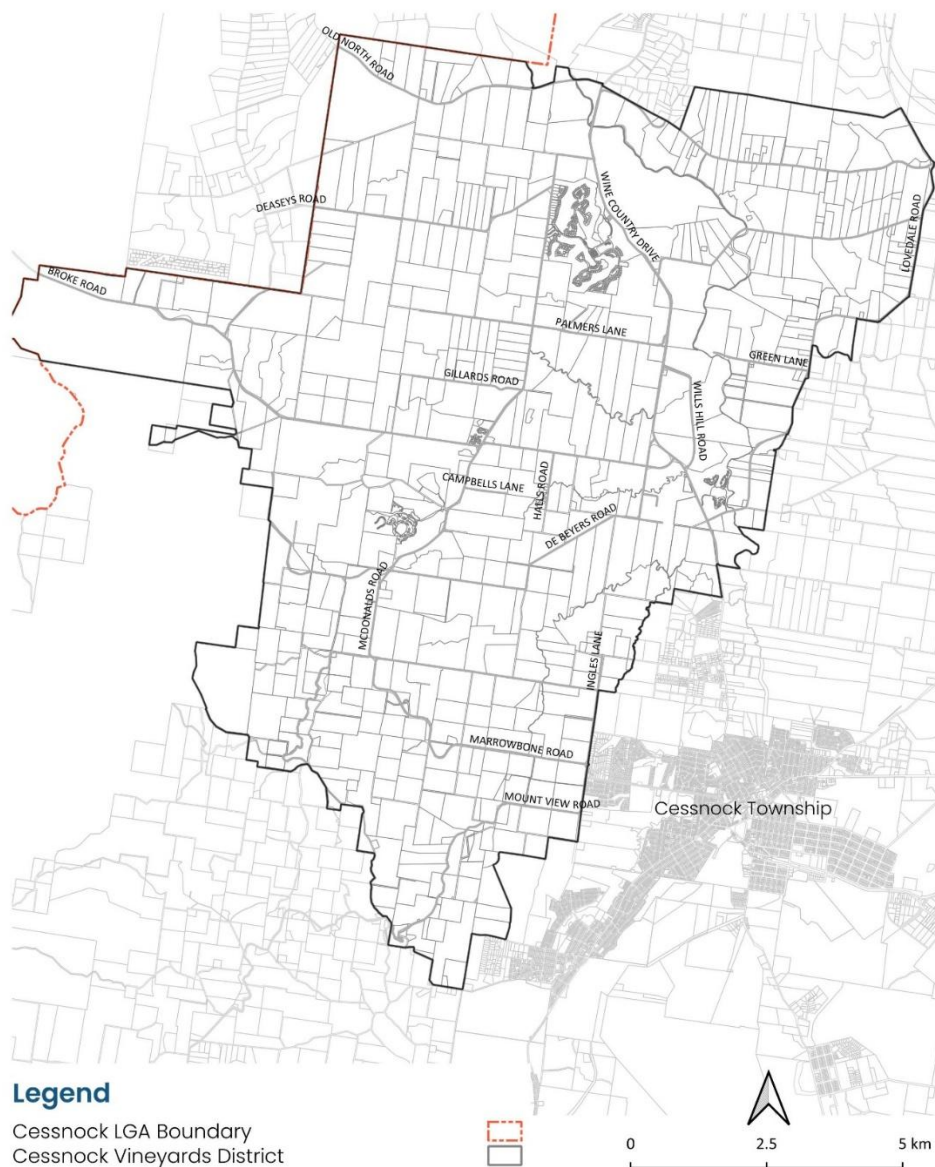
Figure 1 - The Cessnock Vineyards District

In addition to viticulture and agriculture, the Vineyards District supports a variety of tourism developments, including cellar door premises, tourist accommodation, restaurants and cafés, and cultural and recreational facilities and events. Establishing a planning framework for the Vineyards District is challenging due to the diverse land uses, the area's long viticultural heritage, the need to preserve scenic character and amenity, and the potential for land-use conflict with agriculture. Any planning framework for the Vineyards District must encourage a harmonious balance between agriculture, scenic amenity, biodiversity and tourist and other non-agricultural development; all of which are critical to the established character and economic viability of the Vineyards District.