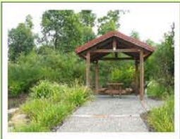
Proposed replacement of picnic shelters and refurbishment of seating