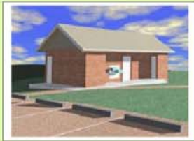
Proposed demolition of toilets and relocate to a more accessible area