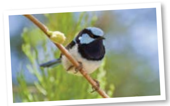
Superb fairy wren

Create a habitat stepping stone to help them out.